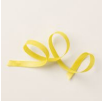
Darling Duckling 3/8" (1 Cm) Faux Linen Ribbon [165272 ] $8.00