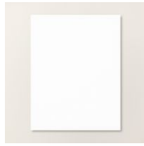
Basic White 8 1/2" X 11" Cardstock [166780 ] $14.00