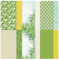
Valley In Bloom 12" X 12" (30.5 X 30.5 Cm) Designer Series Paper [167935 ] $13.00