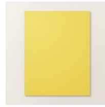
Darling Duckling 8 1/2" X 11" Cardstock [165622 ] $14.00