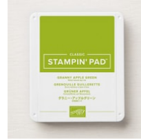
Granny Apple Green Stampin' Pad [147095 ] $9.00