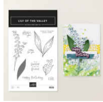
Lily Of The Valley Photopolymer Stamp Set (English) [167937 ] $21.00