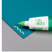
Multipurpose Liquid Glue [110755 ] $6.00