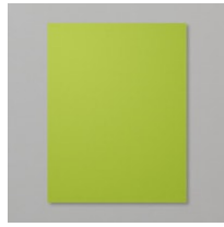
Granny Apple Green 8- 1/2" X 11" Cardstock [146990 ] $14.00